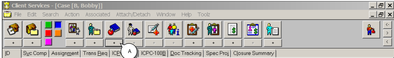
Figure – HE_035